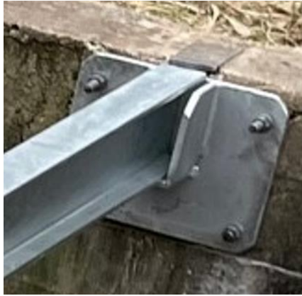
Figure 2: Steel Beam – Wall Connection