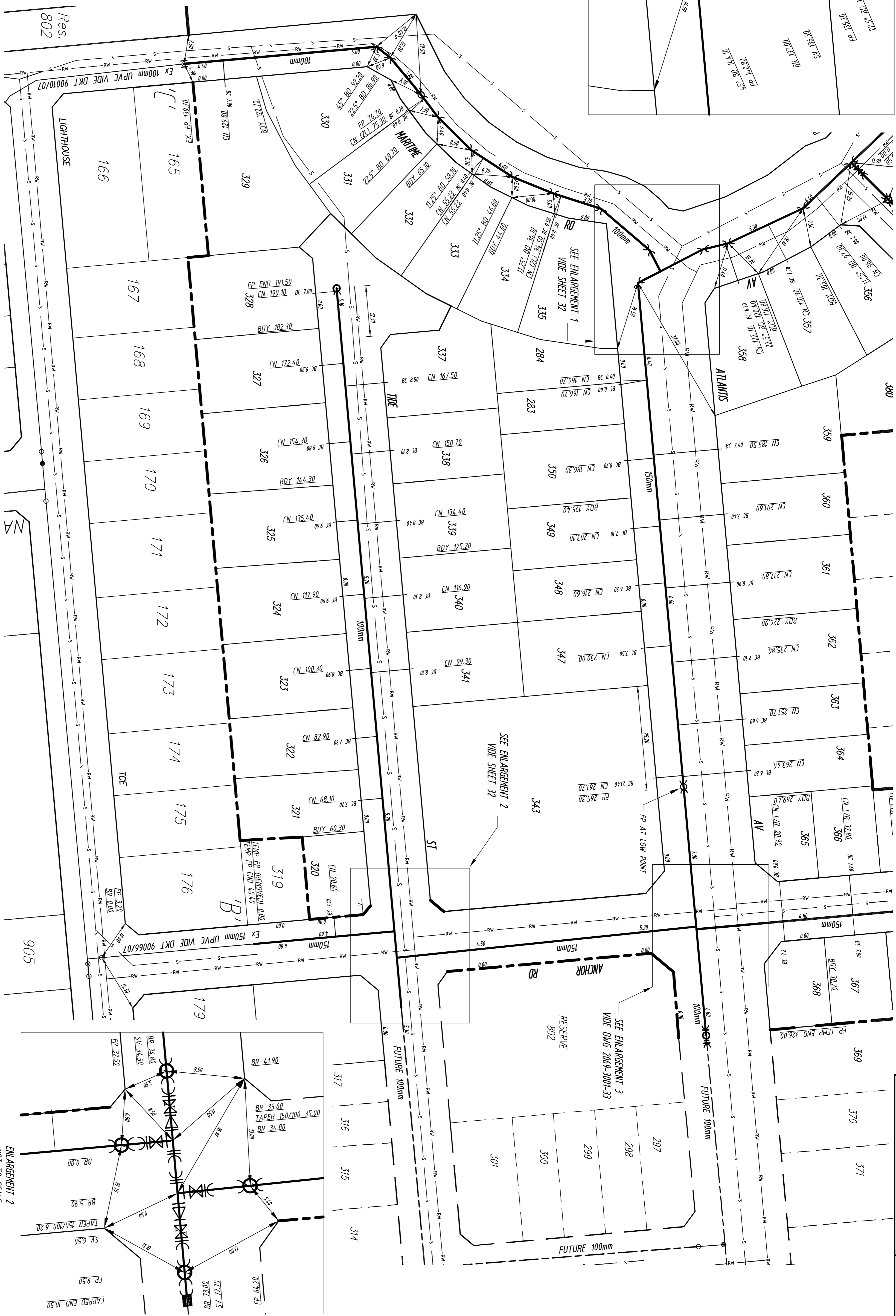
LAYOUT PLAN 0 5 10 20 30 m