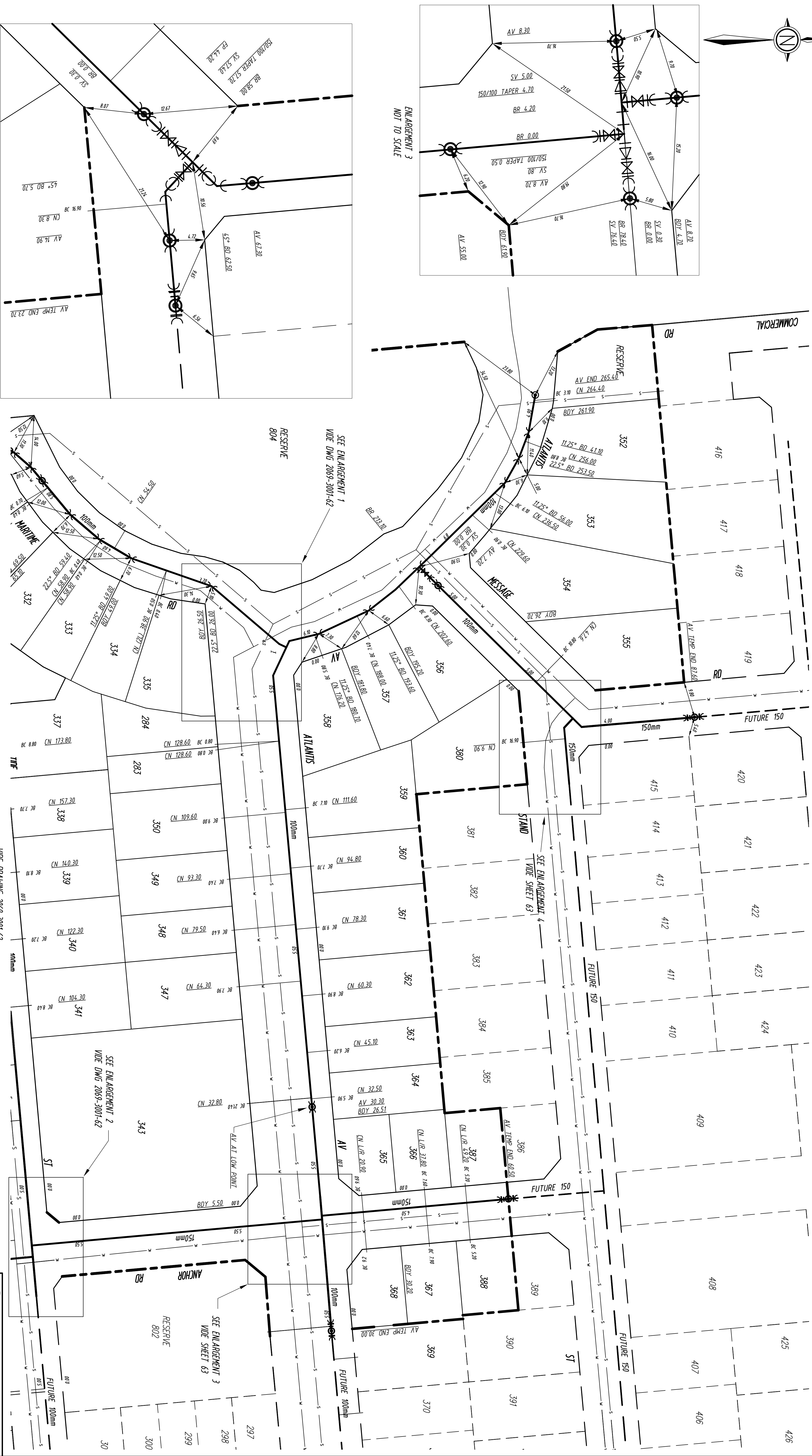
ENLARGEMENT 4 NOT TO SCALE

The accuracy of the information shown here is not guaranteed and no responsibility is accepted by the Crown,SA Water or their officers,agents or servants for any loss or damages caused by the reliance upon thisinformation, as a result of an error and or omission or misdescription hereon, whether caused by negligence or otherwise.Standard SA Water Notes