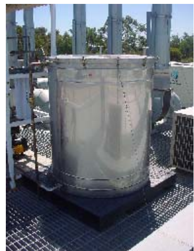
Header tank on roof