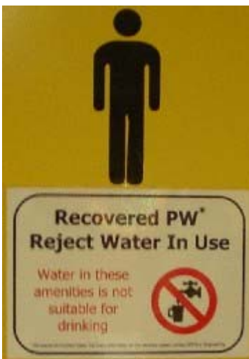
Sign on bathroom doors PW = purified water